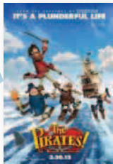
The Pirates! Band of Misfits Saturday, May 12th