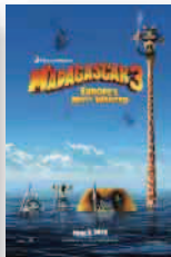
Madagascar 3 Saturday, June 9th