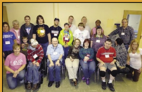
Participants in the Friendsfirst program

This holiday season Friendsfirst decorated a tree for the Festival of Trees. Our tree—"Taste of Italy"—was decorated in an Italian theme, with decorations made by Friendsfirst participants.