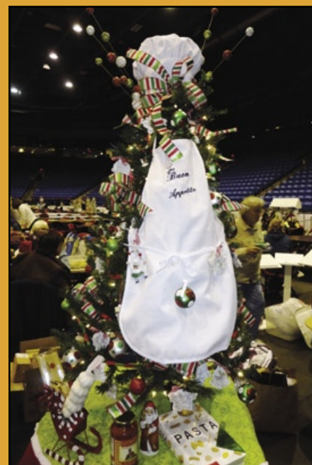
"Taste of Italy" tree decorated by Friendsfirst for The Baby Fold's Festival of Trees event